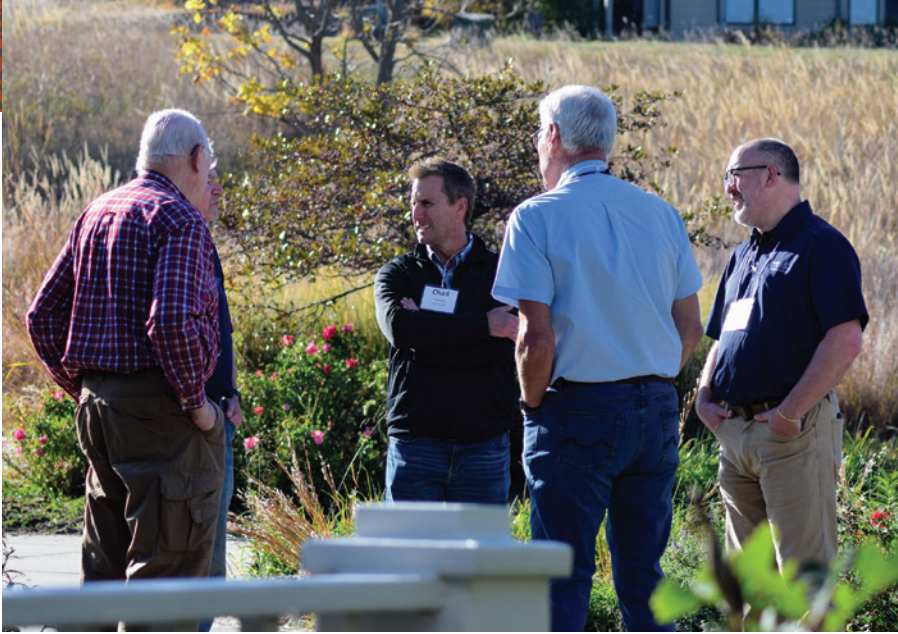
Bold Gathering , continued from page 1

reported on past and current God-filled initiatives in outreach, discipleship, stewardship, retreats, and communications. We reviewed LMM's three-year strategic plan across our many "spheres of influence," from Project XII and its popular, ongoing Lifelines series, to future One Year to Live Retreats and Bold Gatherings, to resource gathering and how best to use the financial and time and talent gifts at our mutual disposal. Ultimately, we came up with a way forward that's exciting and challenging and full of promise for LMM's continued health and growth. We also prayed together, chowed down on some local barbecue, and even watched a little football — standard, fun, fulfilling fall bro-bonding stuff.